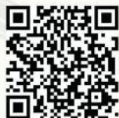
Company Introduction Video